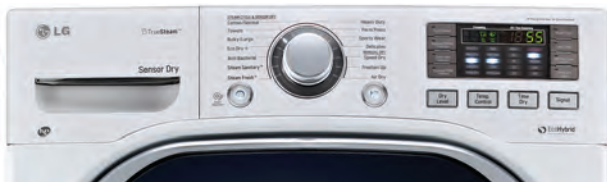
Full Size All-in-One Washer and Dryer